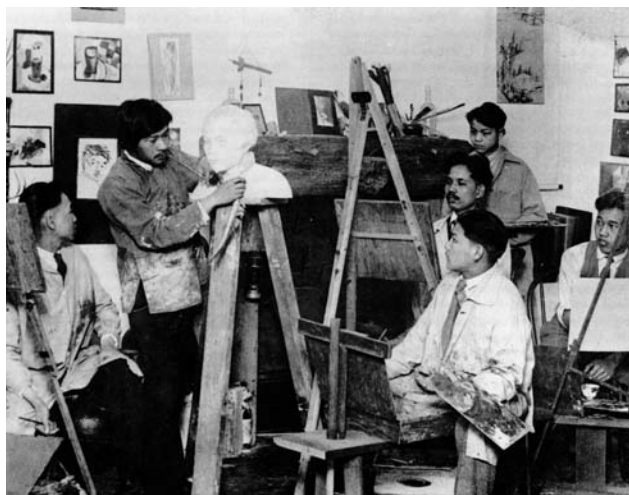
Chinese Revolutionary Artists Club, ca. 1926.

1924 Immigration Act (also known as Johnson Reed Act) passed by Congress severely limits immigration from southern and eastern Europe and denies entry to virtually all Asians.