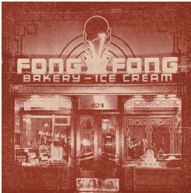
Fong Fong soda fountain, 1935.