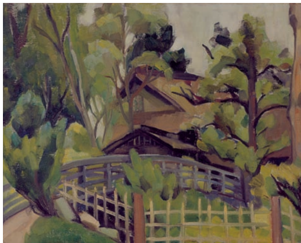
Miki Hayakawa, Japanese Tea House , ca. 1925. Oil on canvas, 19 1/2 x 23 1/2 in.

1924 Immigration Act (also known as Johnson Reed Act) passed by Congress severely limits immigration from southern and eastern Europe and denies entry to virtually all Asians.